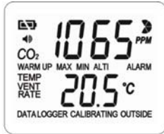
(Display Features and Modes)